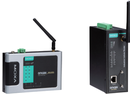
OnCell 5004-HSPA Series